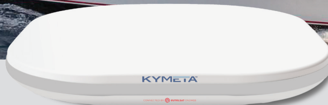
PEREGRINE u8 LEO SATELLITE TERMINAL