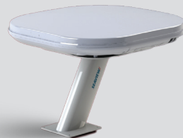
EXAMPLE OF THE PEREGRINE u8 INSTALLED ON AN OFF-THE-SHELF PEDESTAL

*Software-controlled peak power draw. User-configurable to a higher threshold for very low-temperature operation.