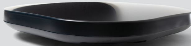
GOSHAWK u8 MULTI-X SATELLITE TERMINAL